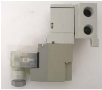
Air Valve without wires