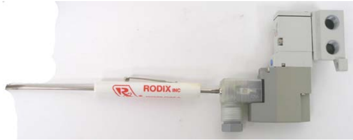
Unscrew cover of valve connector