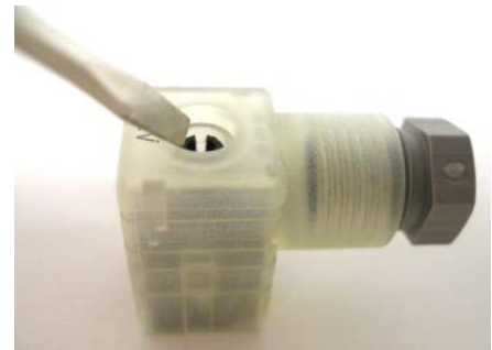
Push on black retainer to release the cover.