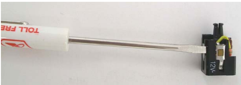
The connector screw is on the side of the connector.