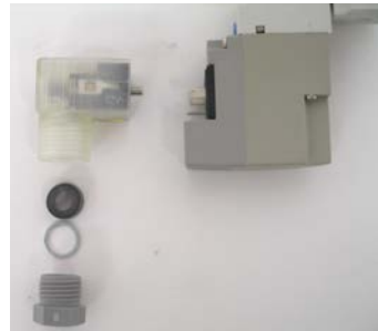
Remove cord grip & seal.